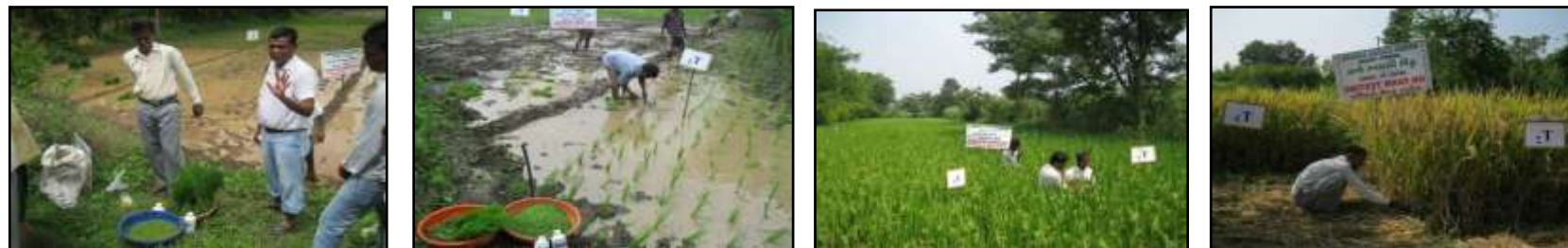
Photographs of OFT Plots of combined application of Azolla and LBF in Paddy.

Paddy growers of the surrounding villages have expressed interest to prepare Azolla nursery units and use of Azolla and LBF in paddy cultivation for healthy agriculture. Under the guidance of kvk as many as 20 Azolla nursery units have been developed. KVK supplied about 500lit. LBF (i.e Azotobactor, PSB,KMB etc.) to the farmers of Pardi block of Valsad.