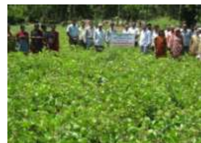
Photographs of summer green gram var. Meha